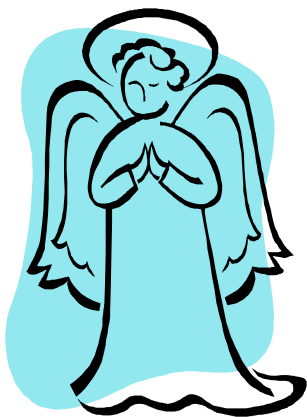
LODGE OF SORROWS